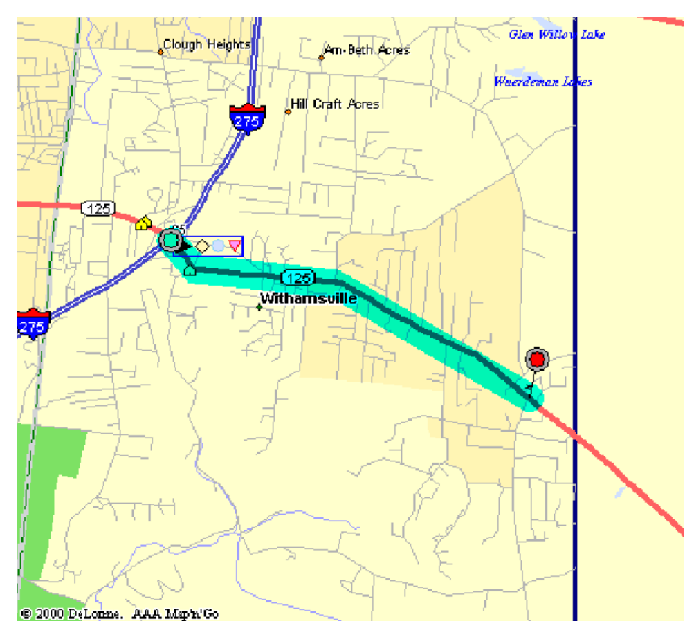
Please note - effective 9/2002 McMann-Ferris Road no longer intersects St. Rt 125. Access is now via North on Merwin-Ten Mile Rd. Left on McMann the Right onto Ferris.

<u>Contact Info</u>: Mike Shebesta - 8:00AM to 10:00 PM 513/474-1186 - Cell 513/235-9644 <u>MikeAbest@Shebesta.com</u> - On Site PHONE 513/753-9000.